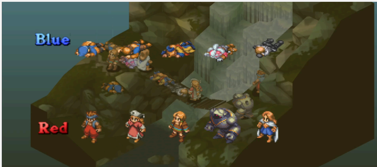
A screenshot of the KO screen is to be submitted to the Tournament Organizer if no Official is present