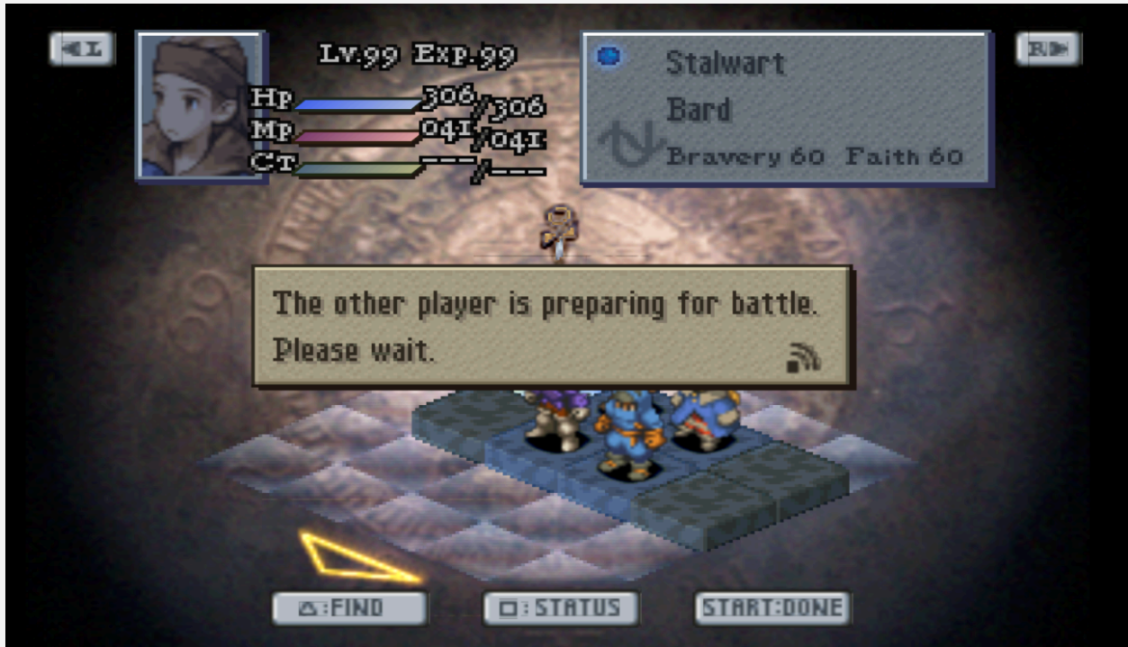
The “Ready” state - the Host should only be in this state when prompted